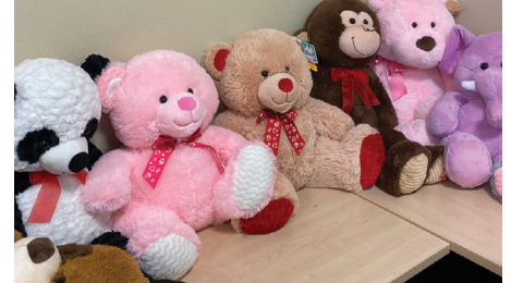
Volunteers continue to make our 'Heavy Helpers' through the pandemic. Volunteers can pick up supplies and drop off via drive thru, or a masked and socially distanced meeting. These weighted, cuddly friends are soothing to patients with sensory processing issues.