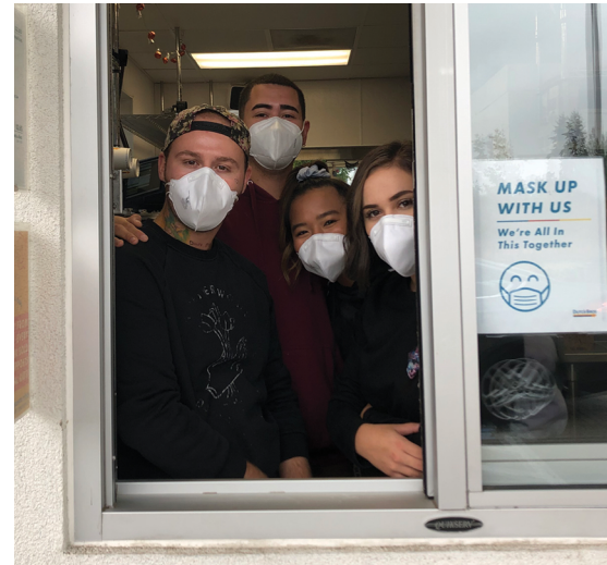
The Dutch Bros team is masked up and ready to (safely) serve at the drive-thru