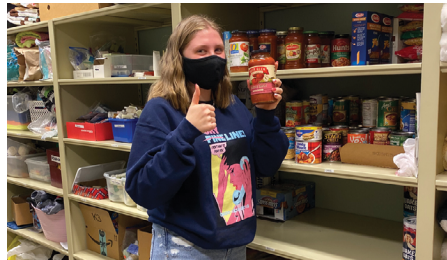
A volunteer helps sort through non-perishable foods to be given to families during our holiday food drive